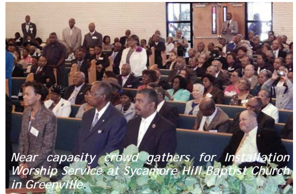
Near capacity crowd gathers for Installation Worship Service at Sycamore Hill Baptist Church in Greenville.