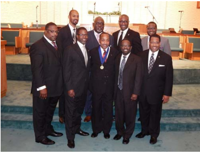
The President's Cabinet (2014 – 2018)

At right, a pensive new President reacts to the standing ovation offered by the worshippers and witnesses to the Installation of the 32nd President of the General Baptist State Convention of North Carolina.