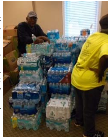
Water is a very precious commodity to persons living in flood affected areas of South Carolina. Volunteers are unloading water from NC friends.