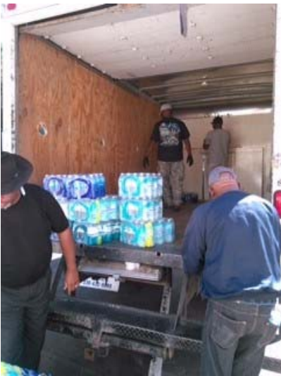
Pictured above, volunteers load 300 cases of water that were delivered to the Columbia, South Carolina area.

Current needs include bottled water, cleaning supplies (especially bleach) and gift cards for the Gadsden location. .